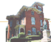
FENTON HISTORY CENTER